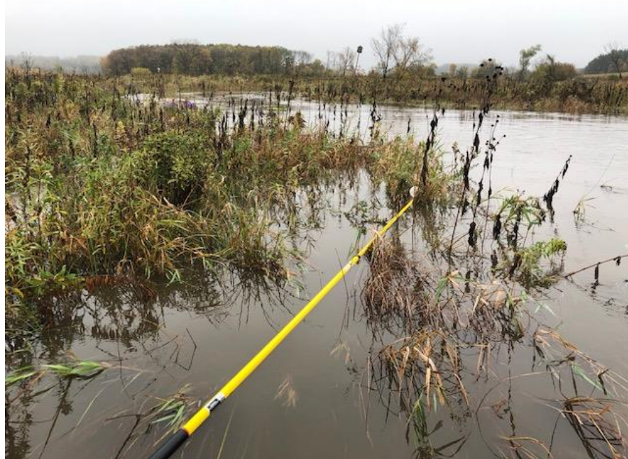
Figure 5. Collecting a water sample during runoff conditions at Trimble River, WI

Pilot project monitoring plan prepared by Kent Johnson, Kiap-TU-Wish Chapter of Trout Unlimited February 2019