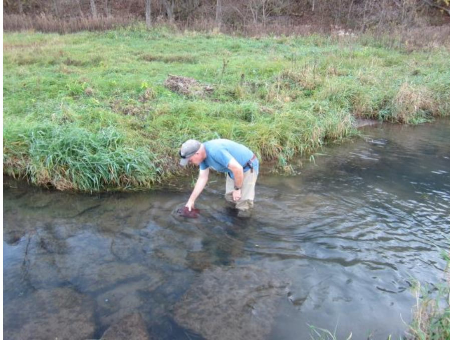
Figure 4. Collecting a water sample during baseflow conditions at Pine Creek, WI.