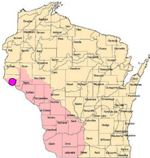
Figure 2. Pierce County, in Wisconsin's Driftless Area